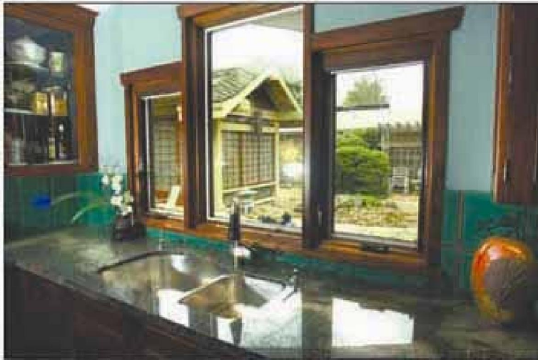
Windows frame a rustic view of a teahouse.